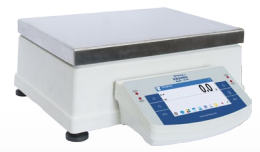
APP X2 Precision balances