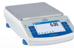
PS 10 X2 Precision balances