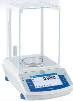
AS X2 Analytical balances

USB interface facilitates quick transfer and copying of any results of your work (measurements, reports, databases) to other balance.